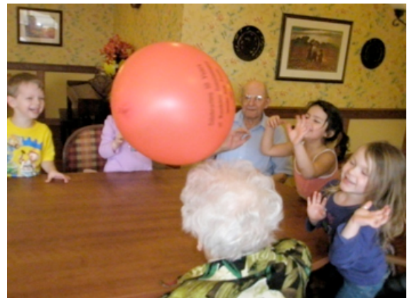
Figure 1. Playing together

Lamentable, but beautiful, this poem illustrates the strong connection that can be made between generations that are far apart chronologically. We have seen this again and again during our year at All Seasons Preschool, a school housed inside of a senior living building. When we embarked on this journey, we were aware of the research about the benefits of intergenerational relationships in broad, generic ways. Our intentions were good and our expectations were high, but they were distant, lofty and not yet tangible. This year we've seen in great and small, but most importantly in very personal ways, the benefits of the relationships that have developed between the young and old. Here, together, those distant and lofty goals transformed into very personal benefits for real people, many of them planned and expected, and many others surprising and unexpected. We witness the small miracles that occur on a daily basis and if we blink, we miss them.