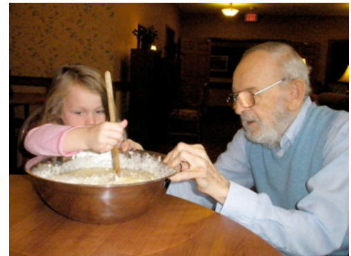
Figure 6. Cooking together