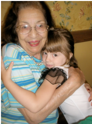
Figure 2. Showing that we care for each other

While I was in college I often visited my grandfather at a nursing home and I noticed how seniors would come alive at the mere sight of a young child. People who were mostly unresponsive would brighten up, smile, talk and reach out to small children. During this same time, I had the pleasure of hearing two charismatic speakers passionately promote the pairing of children and seniors. From that time I hoped that when I became a teacher, I would pursue partnerships with seniors, which I did when I received the grant. I love teaching and working with children, but the highlight of my teaching years has been watching what the children and the seniors could do together, but not alone. This experience planted the seed for what became my long-term goal: to open an intergenerational site that paired two populations that benefit in so many ways simply from being together.