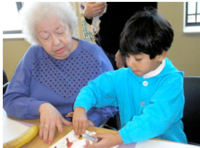
Figure 5. Mutual absorption

Despite obvious differences, when we are together the similarities are what stands out. At any age it takes skill and concentration to throw an apple into a barrel; it takes balance to stand on one foot to kick a soccer ball into the net; it takes a steady hand and the ability to bend to roll a bowling ball. Kneading bread dough is tiring when the muscles in your hands are weak and stiff from arthritis or are not fully developed due to immature muscles.