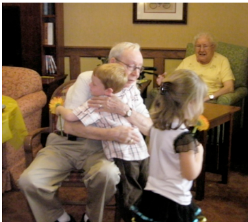
Figure 7. Flowers for the preschool graduation